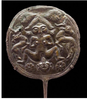
Figure 1. The Oldest Image of a Woman during Vaginal Delivery in the Continental Shelf of Iran. Source: https://raeeka.wordpress.com .