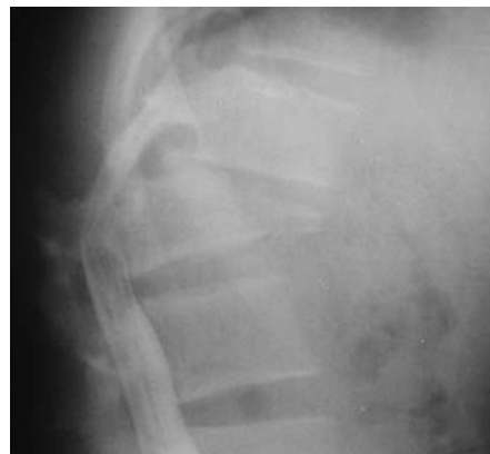
Fig. 3. T12-L1 fracture dislocation in a 17 year old boy due to motorcycle accident.