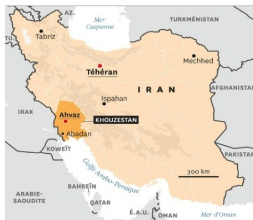
Fig. 1. Location of Ahvaz in Iran

The association between respiratory mortalities with mean daily air pollution was analyzed using a quasi-Poisson, second degree polynomial constrained, distributed lag model using single and cumulative lag structures, adjusted by trend, seasonality, temperature, relative humidity, weekdays, and holidays. Single day lag effects of air pollutant exposure were estimated for 1 to 14- day lags. Distributed lag models (DLM) with 0 to 14- day lags