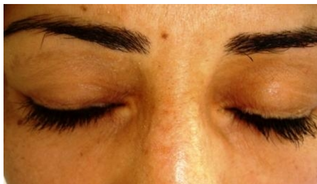
Fig. 1: Flesh colored symmetric beaded papules on the eyelids.

On physical examination of these sisters, numerous flesh colored verrucous symmetric papules were observed on the elbows, knees, feet, toes and fingers. Yellow papules were found on soft palate (Figure1) and multiple beaded papules along the margins of their eyelids (Figure2). Multiple acneiform (pock like) scars were noticed over their forearms and legs. The younger sister had fissured lips and her frenulum was thickened and infiltrated and was unable to protrude her tongue out of the mouth. Other systemic examinations including central nervous system were normal. The routine hematological and biochemical investigations were within normal limits. Skull radiography was normal.