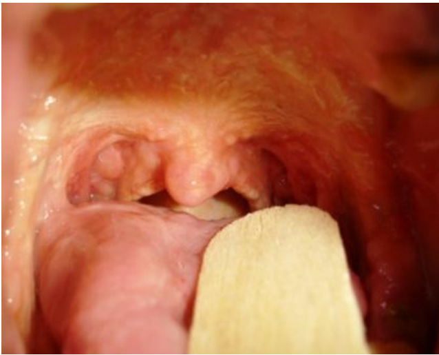
Fig. 2: Yellow papules found on soft palate.

Histological examination of the skin lesions in the elbow showed deposition of a periodic acid-Schiff-positive (PAS +), pink amorphous material in the papillary dermis and around blood vessels and appendages (Figure 3). All these clinical and laboratory data were consistent with lipid proteinosis.