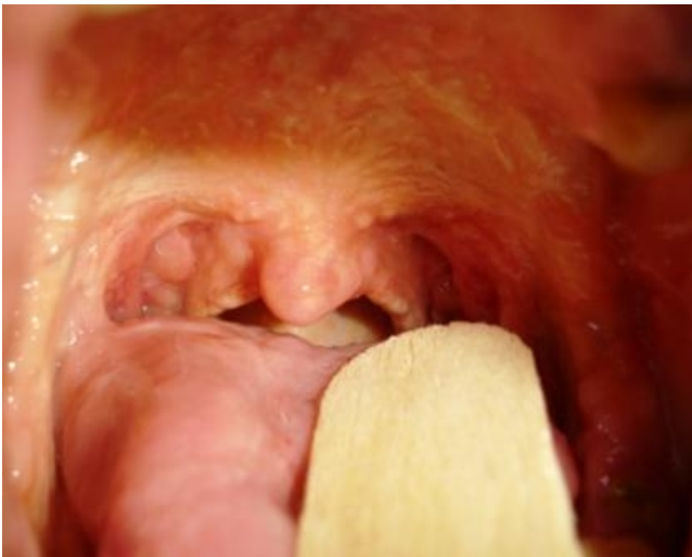
Fig. 2: Yellow papules found on soft palate.

Histological examination of the skin lesions in the elbow showed deposition of a periodic acid-Schiff-positive (PAS +), pink amorphous material in the papillary dermis and around blood vessels and appendages (Figure3). All these clinical and laboratory data were consistent with lipid proteinosis.