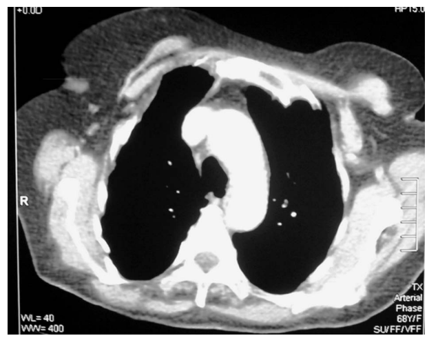
Figure 3. Postoperative Thoracic CT Image in Third Year