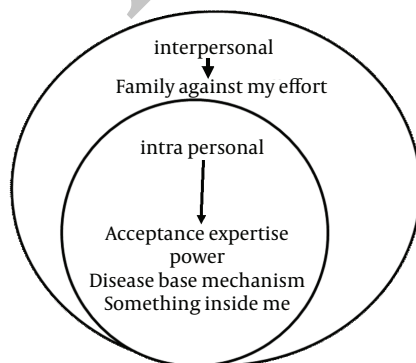
Figure 2. Behavioral Change Challenge Level

A stigma is an attribute that extensively discredits an individual, decreasing his or her from a whole and usual person to a tainted, reduced one. Major et al. (15) (1998) suggested that stigmatization happens when an individual possesses (or is believed to possess) an attribute or characteristic that projects a social identity that is undervalued in a particular social framework. Stigmatizing symbols may be obvious or invisible, manageable or unmanageable, and linked to physical appearance and behavior.