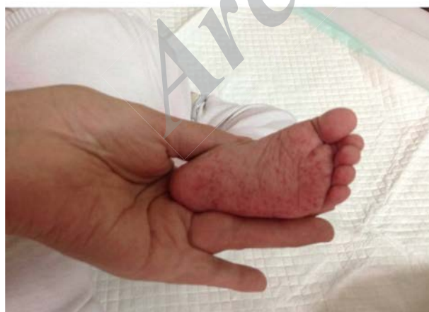
Figure 1. Skin Lesions in Palmar and Plantar Surfaces

A neck ultrasound showed multiple cervical lym-