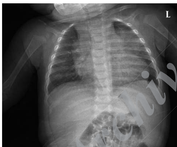
Figure 3. Chest X-Ray Image

ated them very well. Her condition improved, and she was discharged from the hospital after six days. Finally, follow-up showed that her problems were solved, and pericardial effusion was reduced after chemotherapy.