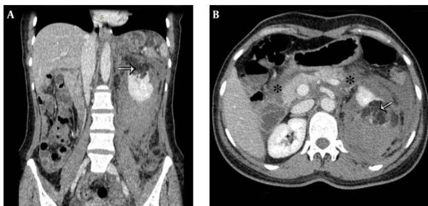
Figure 1. Coronal (A) and Axial (B) Abdominal CT Scans with Intravenous and Oral Contrast

In the upper pole of the left kidney, there is a heterogeneous mass with areas of fat density (arrows). Note that the perinephric hematoma had extended into the peripancreatic space (asterisks).