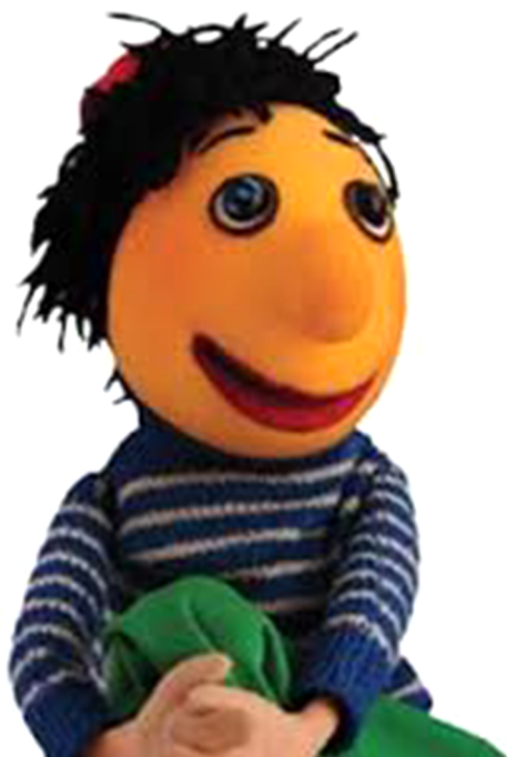
Figure 3. Red Hat Puppet

As a limitation of the current research, the individual differences of children (gender, age, etc.) could affect the anxiety score. It was tried to use randomization and control group to minimize these differences.