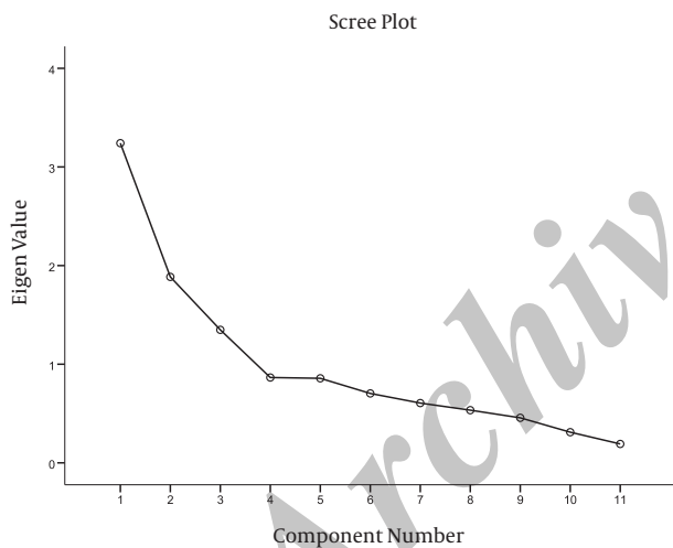
Figure 1. Scree Plot of the Factor Structure of the 3 Factors in NGOs