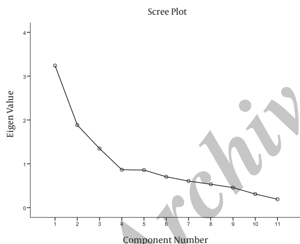
Figure 1. Scree Plot of the Factor Structure of the 3 Factors in NGOs