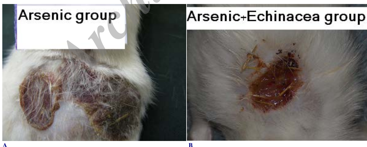
Figure 1. A) Brown scab on the ulcer of arsenic received rat is obvious. B) Note to scab color and size of ulcer in arsenic + Echinacea received rat

In echinacea receiving group, exudate and flocculation on the wound was much lower than the previous group, in contrast immature granulation tissue was seen in the wound site (Fig. 2.3). Abundant fibroblasts, pink fibers secreted from cells, and angiogenesis are characteristics of these tissues (Fig. 2.4). Also, the epidermis of wound edges was quite thick, indicating basal cells proliferation there. Masson trichrome, used to identify collagen fibers, revealed high levels of blue fibers which shows secretion of connective fibers from proliferated fibroblasts.