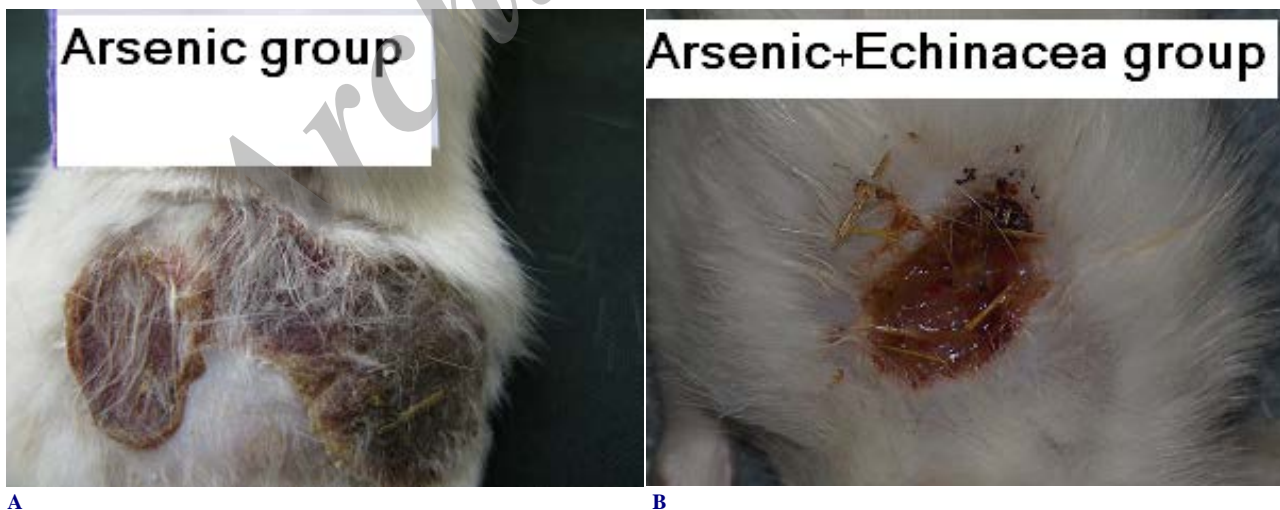
Figure 1. A) Brown scab on the ulcer of arsenic received rat is obvious. B) Note to scab color and size of ulcer in arsenic +Echinacea received rat

In echinacea receiving group, exudate and flocculation on the wound was much lower than the previous group, in contrast immature granulation tissue was seen in the wound site (Fig. 2.3). Abundant fibroblasts, pink fibers secreted from cells, and angiogenesis are characteristics of these tissues (Fig. 2.4). Also, the epidermis of wound edges was quite thick, indicating basal cells proliferation there. Masson trichrome, used to identify collagen fibers, revealed high levels of blue fibers which shows secretion of connective fibers from proliferated fibroblasts.