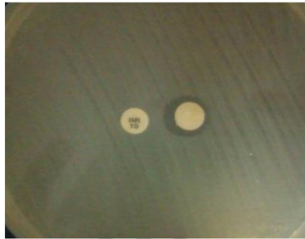
Figure 2. Double Disk Test With Negative Result of non-MBL A. baumannii Isolate

Blank disk (right) is moistened by 5 µL of 0.5 M EDTA. Disks are arranged in 1 cm edge to edge.