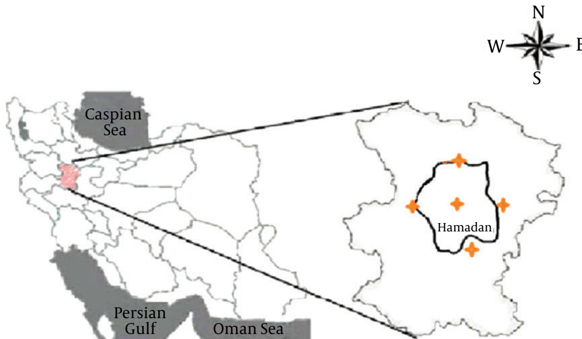
Figure 1. Map of Hamadan City, Shows the Location of the Study Areas