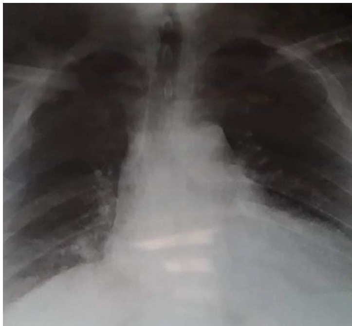
Figure 1. Posteroanterior (PA) view of chest radiograph showing normal chest X-ray

The medical records of the patient showed that on the 2nd of August, 2020, he had experienced one day of fever and dry cough. Nevertheless, the patient was hemodynamically stable, non-hypoxic ( SpO_2 : 97% without oxygen), and febrile ( 38.5^\circ C ). In addition, the patient had a history of contact with positive SARS-CoV-2 cases, and the results of the RT-PCR for SARS-CoV-2 became positive again. As such, treatment was initiated with azithromycin (500 mg qDay), zinc tablets (50 qDay), and vitamin D (5,000 I.U qDay). Clinical improvement was observed in the patient, and two successive RT-PCRs for SARS-CoV-2 showed negative results on the 22nd of August (Figure 2).