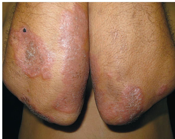
Figure 5. Haematoxylin & Eosin stained section of skin biopsy showing chronic granulomatous infiltrate with multiple non-caseating epithelioid cell granulomas without peripheral rim of lymphocytes in the papillary dermis. (x100)

Sarcoidosis may be acute or chronic. Acute sarcoidosis has an abrupt onset, is more frequent in Caucasians, and may present as Löfgren’s syndrome which is characterized by bilateral hilar adenopathy, ankle arthritis, erythema nodosum, and frequently constitutional symptoms including fever, myalgia, malaise and weight loss. The prognosis is good and spontaneous remission usually occurs within two