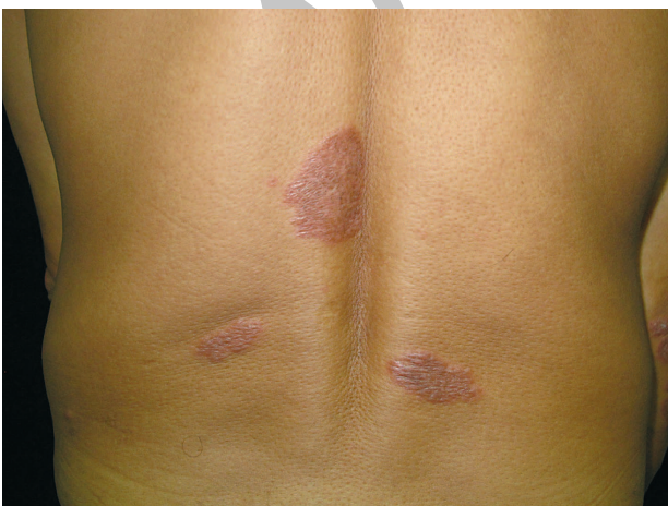
Figure 2. Well defined brown colored infiltrated plaques with 'peau d' orange' appearance.

hypopigmented atrophic zone. Lesions on the lower back showed a granulomatous morphology with a 'peau d' orange' appearance. (Figure 2) The rest of the examination of the oral cavity and genitalia did not show any abnormalities. There was no evidence of any peripheral nerve trunk enlargement or lesional loss of sensation. Deep dermal tenderness (Buschke Ollendorff sign) was not present. We considered a differential diagnosis of psoriasis vulgaris, psoriasiform sarcoidosis, and borderline lepromatous Hansen's disease.