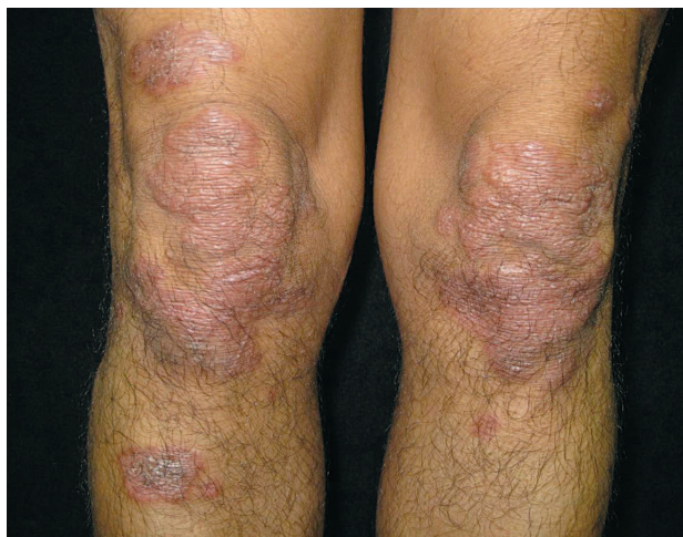
Figure 4. Computed tomography of the chest showing interstitial fibrotic changes in both the lungs fields.

Computed Tomography (HRCT) of the chest showed pretracheal, subcarinal and hilar lymphadenopathy, cystic spaces, reticulonodular opacities and interstitial fibrosis (Figure 4). Pulmonary function test showed a restrictive pattern with reduced Forced Vital Capacity (FVC) and normal FEV 1. Ocular examination did not reveal any signs of uveitis. The patient did not give consent for broncho-alveolar lavage.