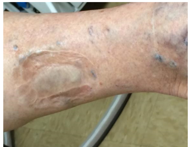
Figure 2. Large bulging veins in the left leg and signs of a dry wound on the inner shin.