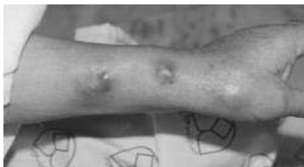
Figure 1. Three separate abscesses along the cephalic vein of the left forearm

grew Staphylococcus aureus . The patient received intravenous vancomycin for 2 weeks and made a full recovery. Blood cultures (three in all, with intervals of 2 days) after 7 days of incubation did not show Staphylococcus aureus . Stool and urine cultures were also negative.