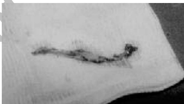
Figure 2. Cephalic vein excised surgically from the left forearm