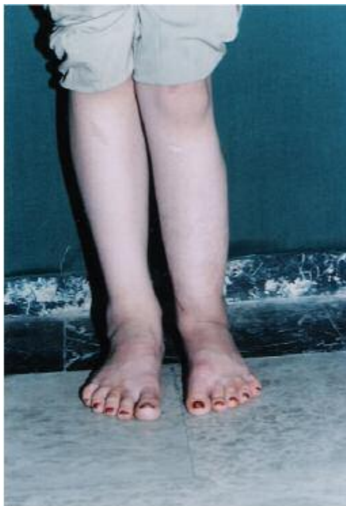
Figure 5. No LLD is present after four years follow up.