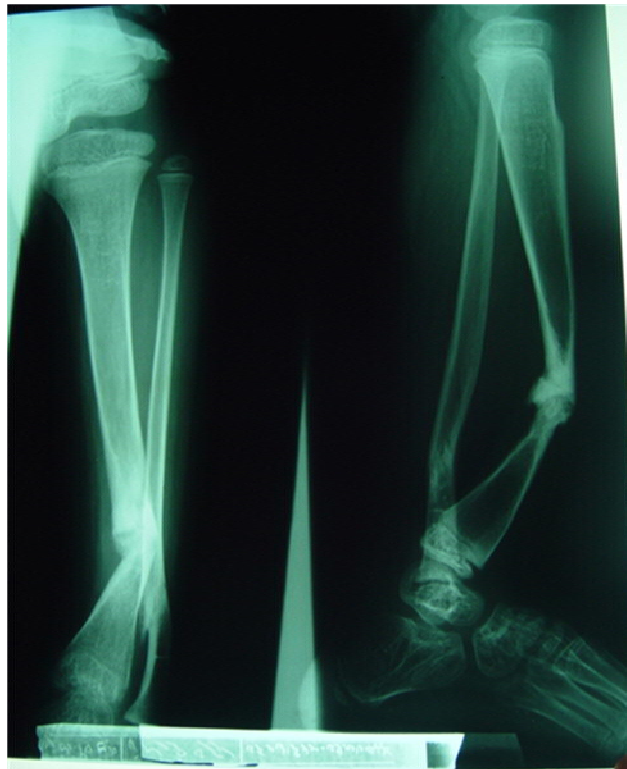
Figure 1. Radiological study of congenital pseudoarthrosis of tibia in 7 years old girl.

She also has no significant limb length discrepancy. The amount of valgus is less than 20 degrees. After 4 years of follow up, no sign of recurrence is evident (figures 4 and 5).