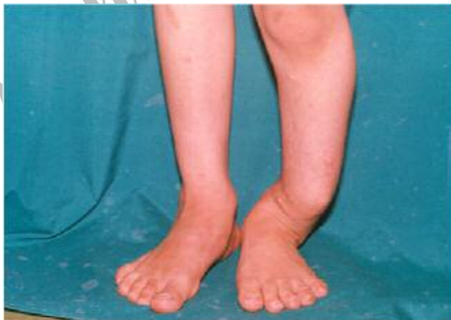
Figure 2. Congenital pseudoarthrosis of tibia in 7 years old girl.