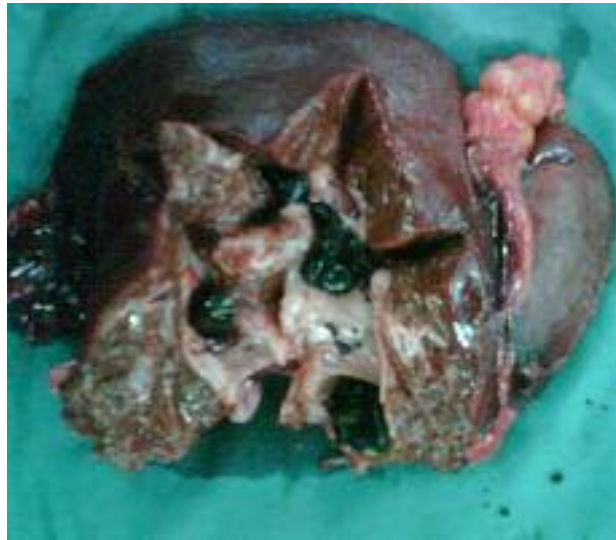
Figure 3: Resected left liver lobe. Intrahepatic bile duct cysts with stone formation are visible.