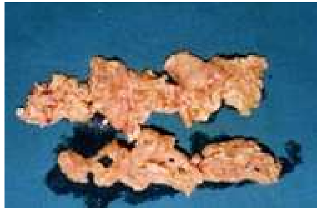
Figure 2. The gross view of Intracranial foreign body