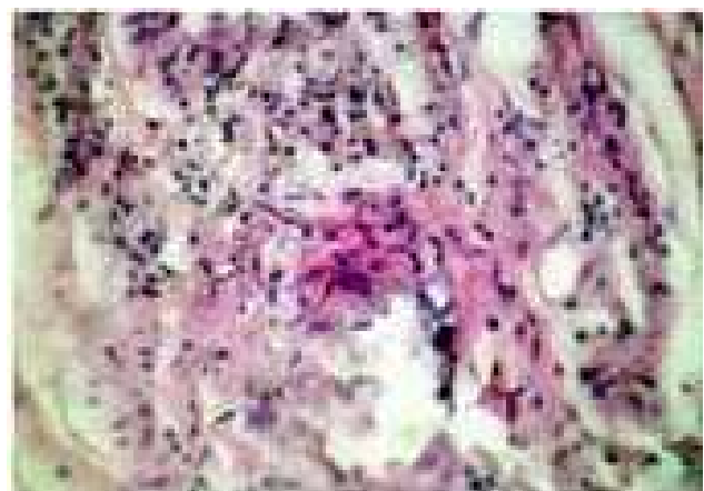
Figure 3. Microscopic view of the Intracranial foreign body