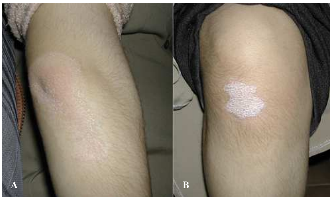
Figure 2. A) Painless patches on extensor surface of the arm. B) Painless patches on extensor surface of the leg

With the classical features of massive lymphadenopathy and evidence of sinus histiocytosis and the histopathological features of lymph node, diagnosis of RDD was approved. The patient was treated with Prednisone (40 mg/d) for a period of one month, and thereafter the dose decreased and Azathioprine 1 mg/kg was added. After one year, prednisone discontinued and all of the symptoms and