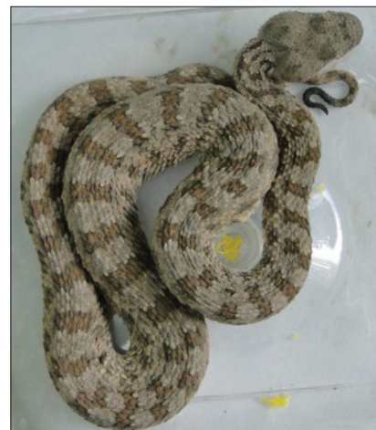
Figure 3b: Pseudocerastes fieldi