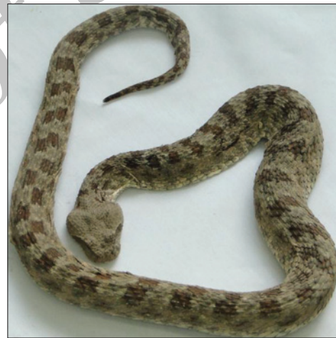
Figure 2: Pseudocerastes persicus