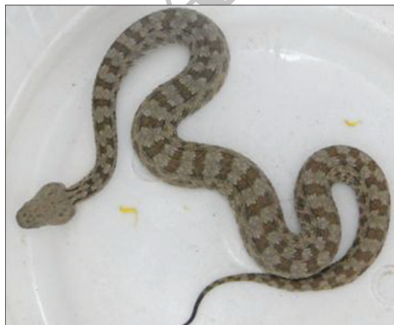
Figure 3a: Pseudocerastes persicus