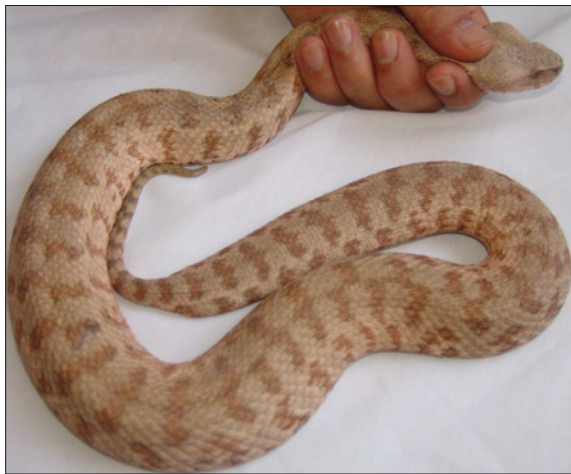
Figure 1: Macrovipera lebetina obtusa