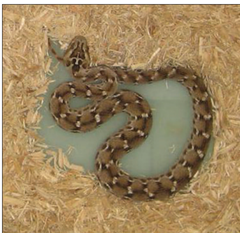
Figure 4: Echis carinatus