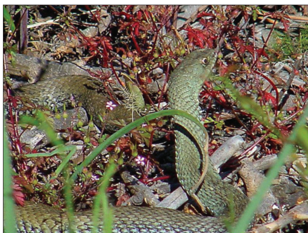
Figure 5: Malpolon monspessulanus insignitus