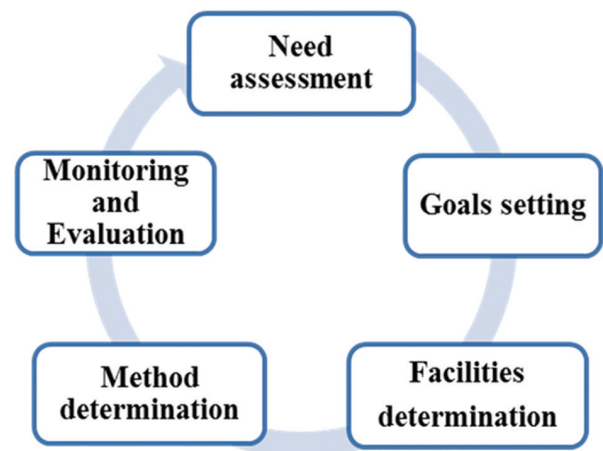
Figure 1: Development and implementation of smart investment

As mentioned, smart investment in the field of noncommunicable diseases will have a direct impact on the economic, political, social, and cultural dimensions. The health system's performance in the field of noncommunicable disease will be promoted if the fundamental steps toward smart investment are taken. Smart investment steps are shown in Figure 1. The stages of the development and implementation of smart investment planning can include the dimensions described in Table 1 encompassing all aspects of noncommunicable disease. In the early phases of smart investment, one must know the idea and get the right understanding of the investment. In the field, all stakeholders are justified to understand investment procedures and to provide basic information. The health department should provide a simple, systematic, and organized solution for smart investment in noncommunicable diseases field and those solutions with regard to the current and future status. The smart investment describes the dilemmas and tips and points out how to ask smart questions from investment advisers and experts, and to set clear goals and to make the right decision in noncommunicable diseases field.