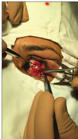
Figure 2: Marginal myotomy of the lateral rectus. A resection clamp is placed across the muscle about 4 mm from its insertion

The present study had two groups each with 14 eyes from 14 patients who underwent strabismus surgery. A total of 28 cases were successfully treated and completed the course of the study. The mean \pm SD age was 18.3 \pm 12.0 and 18.4 \pm 11.3 years in the MRR/MM group and MRR group, respectively ( P > 0.05 ). All patients had unilateral recession [Table 1]. There was no statistically significant baseline difference between the two groups in terms of PFW ( P > 0.05 ), AHP ( P > 0.05 ) and up/downshoot ( P > 0.05 ). The difference in preoperative ocular deviation in the primary position of gaze was not statistically significant in