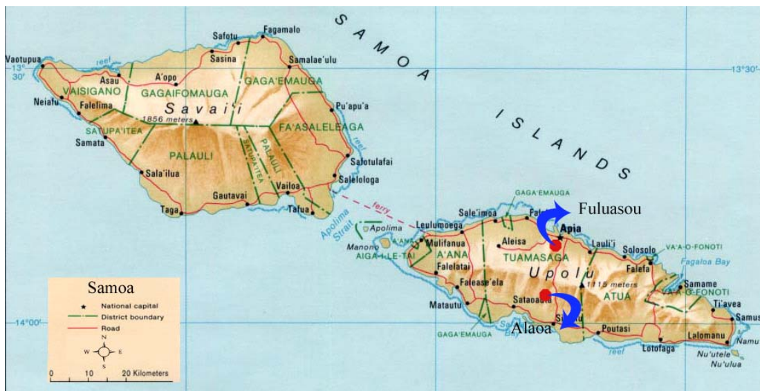
Fig. 2: Map showing sampling locations in Samoa

(APHA, 2003) added due to samples that contains residual. Much care was taken with glassware clean-up to avoid contamination. After sampling, all samples were stored in the dark at the temperature between 0 °C and 4 °C before analysis. The samples from Samoa were transported to Japan immediately after sampling.