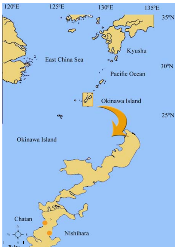
Fig. 1: Map showing sampling locations in Okinawa, Japan

samples from Samoa were collected in 22 nd August and 20 th December 2003. Sampling from treatment plants and consumption sites were conducted simultaneously. Chatan (CTP) and Nishihara (NTP) water treatment plants were selected for this study because they distributed water to the most populated city (Urasoe, Ginowan) areas in Okinawa. Fulusou (FTP) and Alaoa (ATP) treatment plants were selected from Samoa which they also distributed water to the urban areas. The consumption sites from cities (Okinawa) and urban areas (Samoa) were selected for this study. Either ozonation and chlorination or combinations thereof were the two techniques for disinfection of drinking water in all treatment plants in Okinawa and Samoa. Duplicate tap water and raw water samples were collected in 500 mL amber volume glass bottles previously cleaned with acetone and large volume of distilled water and then dried for 2 h. at 100 °C. The bottles were firstly washed with sample water or tap water and then completely filled with water samples so that no headspace was left in them. Samples were preserved by acidification with 6N/40 mL of HCl and with 0.5 g of Ascorbic acid (C 6 H 8 O 6 )