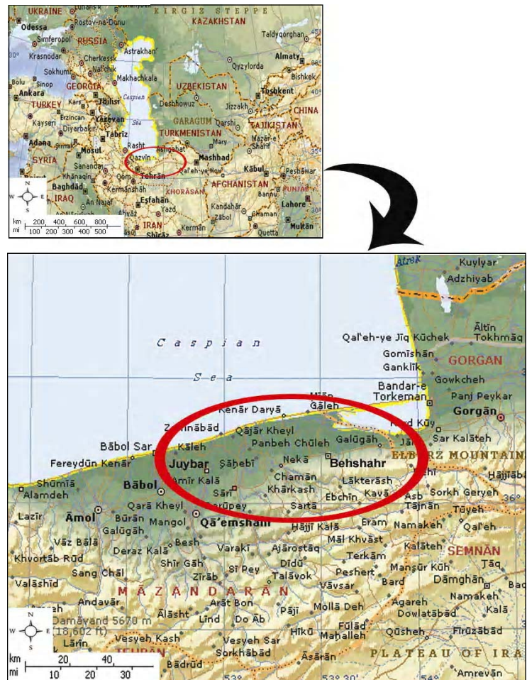
Fig. 1: Geographic location of the study area along the southern coast of the Caspian Sea, between Juybar and Behshahr regions