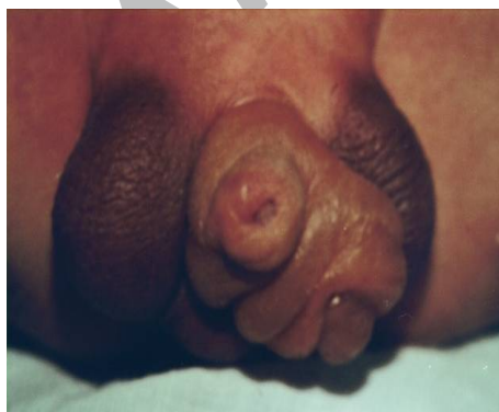
Fig. 1: Diphallus and bifid scrotum

There were normal penile shaft and bifid scrotum with each compartment containing a testicle (Fig. 1). Perineal examination showed imperforate anus. The values of blood analysis were within normal ranges. Abdominal sonography showed distended bowel loops and bilateral normal kidneys. The day after admission he underwent laparotomy and colostomy, the colon was distended and duplicated (Fig. 2).