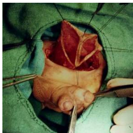
Fig. 4: Double bladder and urethra before reconstruction

present case, colon duplication was of tubular form. The etiology is due to an alternation during embryonic development, but is still not completely understood [3,4]. The surgical treatment of midgut duplication is mandatory [9]. Azmy has reported complete duplication of the hindgut which had two anal openings and a lower urinary tract with diphallus [11] .