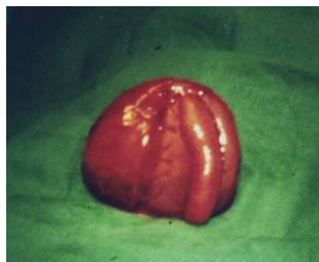
Fig. 2: Distended and duplicated colon

Duplication of the digestive tract is uncommon [1,2] , and they may be associated with different congenital anomalies such as anorectal malformation and lower genitourinary abnormalities [6] . The most common type of colorectal duplication is the cystic form, which localizes in the retrorectal area [7,8] and may therefore be confused with teratoma, dermoid cyst and anterior meningocele [9,10] . In the