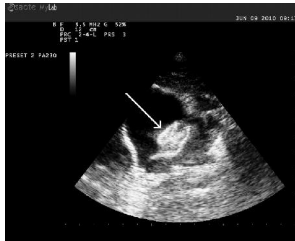
Fig. 1: Echocardiographic image of the atria, interatrial septum and septal occluder (white arrow) during catheterization, showing optimal position of the occluder.

In the first failed patient (2.5 years of age, 12 kg), the measured defect size by echo was 10 mm. During the procedure, the defect could be stretched up to 16 mm. We first tried to deploy a 12mm metallic device and then a 14 mm one, but both trials were unsuccessful. As patient's total septal diameter (around 30 mm) was not large enough to accept a bigger device, we ended device closure. In the second failed patient (8.5 years of age, 18 kg), the unstretched and stretched defect diameters were 26 and 29mm, respectively. We