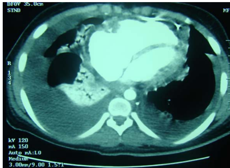
Fig. 1: Chest CT scan with contrast revealed large amount of pericardial effusion and anterior mediastinal mass

adhesion to the aorta, very thick pericardium and inflammation between the pericardium and myocardium and two large right atrial masses (6.2, 2.5 cm) were seen. Surgical excision of the mediastinal and right atrial masses was performed and epicardial temporary pace was fixed for prevention of arrhythmia and sudden death.