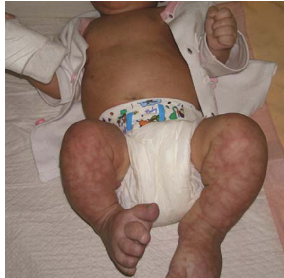
Fig 1: Extensive port-wine staining of the lower extremities; note the widened interphalangeal cleft especially in the right foot

Klippel-Trenaunay syndrome is characterized by a triad of port-wine stain, varicose veins, and