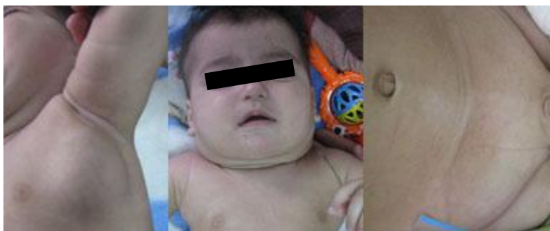
Fig. 1: Cervical, axillary and inguinal lymphadenopathy

admitted to the pediatric infectious disease ward. The patient was a healthy infant till three months ago as his mother noticed a large node on the right side of his neck that had progressive growth and occupied a large portion of cervical area. There was a low grade fever, but no history of upper respiratory tract infection, dyspnea or dysphagia. The child was breastfed and also received supplementary nutrition. Past medical and family history was normal. Clinical examination showed a healthy male infant weighing 8600 gr, length 67 cm and head circumference 45 cm. He had an appearance of bull neck due to bilateral cervical and mandibular LAP. Lymph nodes were discrete, non tender, mobile, matted and about 2 to 6 centimeters in diameter; left axilla and groins also were involved with lymph nodes of almost equal size (Fig 1). Chest x-ray was normal but the skull X-ray showed some lytic lesions in calvarium. The abdominal sonography was normal. White blood cell count 13140/mm 3 , neutrophils 55.4%, lymphocytes 39.1%, monocytes 4.2%, eosinophils 1.1%, basophils 0.2%, platelets, 530000/mm 3 , ESR 56 in the first hour. Hemoglobin 10.3 g/dl.