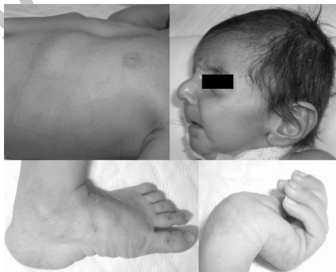
Fig. 3: Photographs of our second patient.

The fingers were abnormally long but the toes appeared normal (Fig. 3). Both thumb and wrist signs were positive. The elbow joints had limitation of motion. A deep pectus excavatum was evident (Fig. 2). Cardiac examination revealed a grade III/VI holosystolic murmur over the left