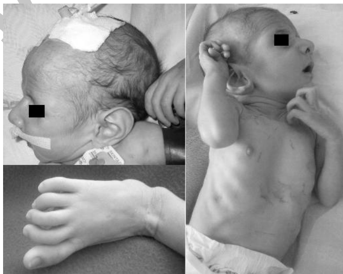
Fig. 1: Photographs of the first patient

A 90-day old male infant was referred due to respiratory distress. He was born preterm through cesarian section due to maternal oligohydramnios with a weight of 2060 grams. He was the first