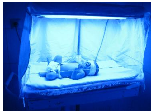
Fig. 1: White plastic cover around the phototherapy unit

All the infants under study, before starting phototherapy had detailed physical examination and necessary tests including determining blood group of mother and infant, peripheral blood smear, reticulocyte count, direct and indirect