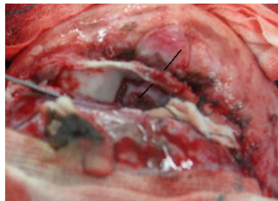
Fig. 2: Intraoperative photography confirms the basal mass which was in continuity with nasal mass (black line) and displaced two ethmoidal cells laterally

Teratoma is the most frequent congenital tumor with early presentation at birth [3] . Head and neck teratomas account for 2-9% of all teratomas [2] .