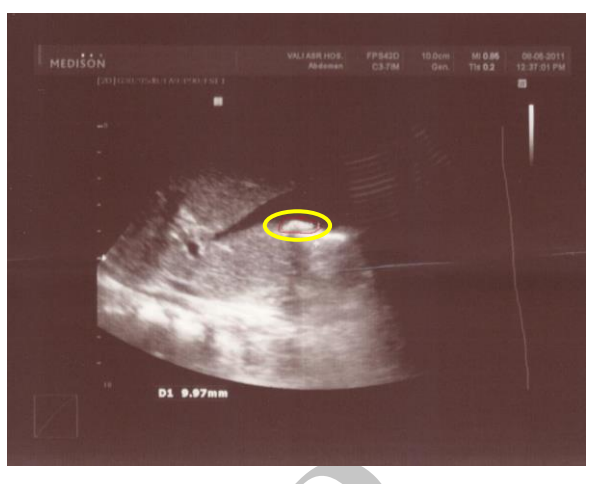
Fig. 2: Circle shows stone in the gallbladder

Comparison of the groups with and without nephrolithiasis demonstrated no significant differences with respect to age, body weight, dosage of drug and the duration of treatment. Nephrolithiasis showed a significant relation with male gender (P=0.02) (Table 1).