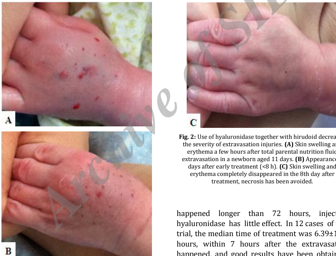
Fig. 2: Use of hyaluronidase together with hirudoid decreased the severity of extravasation injuries. (A) Skin swelling and erythema a few hours after total parental nutrition fluid extravasation in a newborn aged 11 days. (B) Appearance 2 days after early treatment (<8 h). (C) Skin swelling and erythema completely disappeared in the 8th day after treatment, necrosis has been avoided.

injecting hyaluronidase is 8 hours, and 3 hours for high risk medications, such as dopamine and epinephrine. But if exceed the golden time and the extravasation has done damage to the patient or developed to grade 3 or grade 4, hyaluronidase is still injected to prevent further damage, and has been effective. However, if the extravasation has