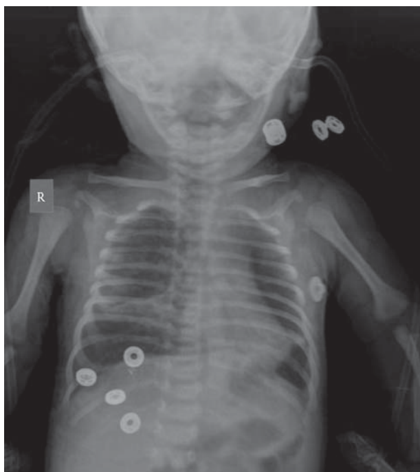
Figure 2. The Patient's Chest Roentgenogram Demonstrated Bilateral Pulmonary Infiltrations and Atelectasis