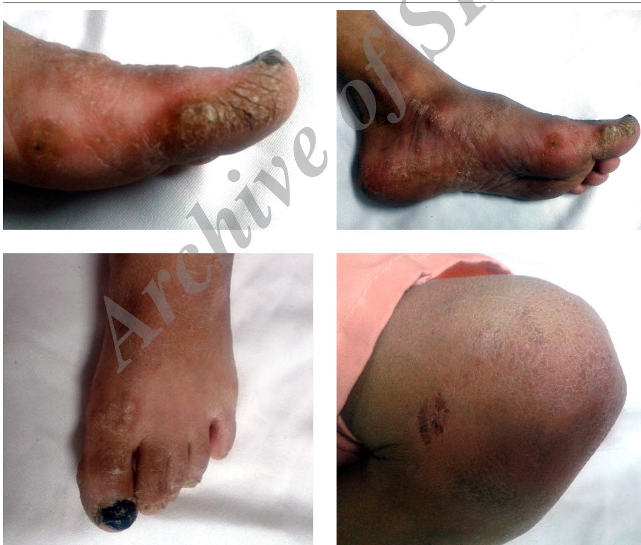
Figure 1. Palmoplantar Distribution of the Skin Lesions

A holosystolic murmur was heard at the apex radiating to the axillary region, and a gallop rhythm was detected. She had no organomegaly except for palpating the liver about 3 to 4 centimeters below the rib edge. No clubbing or more important findings were found. The chest X-ray showed cardiomegaly (Figure 2). On echocardiography, the left ventricle was dilated and had a non-compaction pattern with its ratio to the compacted compartment more than 1.4/1. The M-mode displayed a decreased ejection fraction and an increased E point septal separation (EPSS).