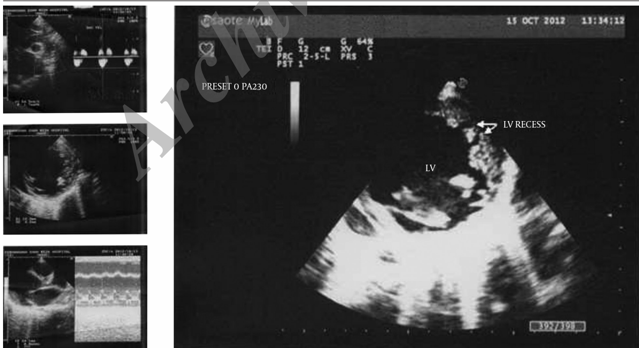
Figure 3. M Mode Echocardiography Showing LV Ejection Fraction and Increased EPSS (Left) and Short Axis View Demonstrating LV Recess in Favor of LVNC

LVNC, a cardiomyopathy of unknown cause results in elements of both left ventricular dilatation and restriction. The condition may be diagnosed at any age, from infancy to young adulthood, and the severity of heart failure varies. The echocardiogram is diagnostic and shows a specific pattern of left ventricular hypertrophy with deep muscular crypts. Patients may be at risk for ventricular arrhythmias and sudden death, as well as mural thromboses and stroke. Although some patients may