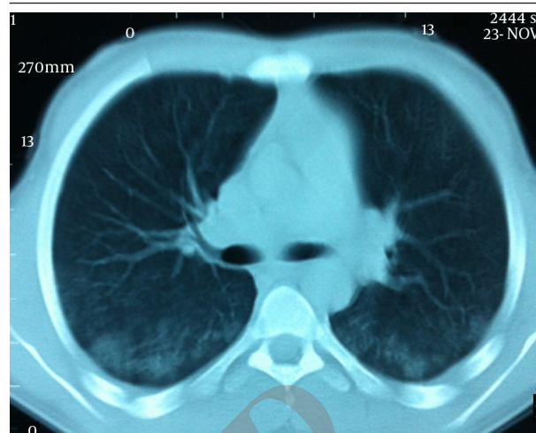
Figure 1. More Distinct Diffuse Ground Glass Densities in Both Lungs at Posterobasal Zones

A 9 year-old male patient was admitted to our clinic with complaints of paleness, weakness and hemoptysis since 3 - 4 days ago. His body weight was 26 kg (10 percentile) and height was 130 cm (25 - 50 percentile). Apart from 1/6 systolic murmur in cardiac examination, no specific sign was determined. The peripheral blood smear was compatible with severe hypochromic microcytic anemia. Bone marrow biopsy revealed active erythropoiesis. Laboratory data are as follow: serum iron 18 µg/dL, TIBC 404 µg/dL, ferritin 12 ng/mL. The thoracic CT scan revealed areas of higher density with ground glass appearance characterized by extensive alveolar involvement in both lungs. Fiberoptic bronchoscopy was performed and many hemosiderin laden macrophages were found in BAL fluid. Diagnosed with IPH parenteral steroid treatment with a dose of 2 mg/kg/day was initiated and erythrocyte transfusion support provided. Since the Anti Gliadin IgA and IgG and Anti Endomysium antibodies were found to be positive, GIS endoscopy was performed and the duodenal biopsy revealed MARSH 3B histological findings compatible with celiac disease (Figure 3). No remarkable finding was established in other examinations. Gluten-free diet was commenced for celiac disease. In the follow-up, steroid treatment was tapered gradually and discontinued, gluten-free diet was continued and hemoglobin level returned to normal in nine months.