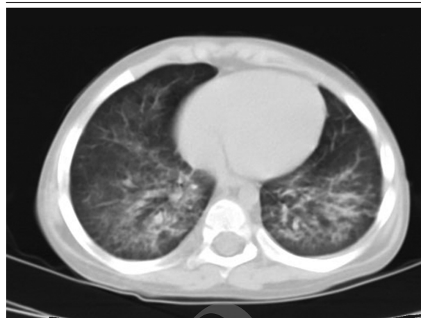
Figure 3. High-Resolution Computed Tomography Scan of the Chest Showing Dramatic Improvement in Both Lungs After Multiple Segmental BAL