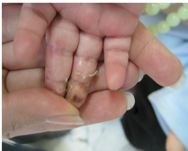
Figure 3. Distal Cyanosis and Scaling in Hands and Gangrene of the Distal Phalanx of the Middle Finger in the Repair Phase

nary aneurysms. He was admitted again. This time echocardiography findings were as follow: LMCA diameter 7.4 mm, RCA 4.3 mm, and LAD 5.2 mm. With continuation of aspirin, warfarin, and azathioprine (for 3 months), second pulse of methylprednisolone and IVIG and Infliximab were given. After a year cardiovascular angiography revealed: 4.5 mm diameter aneurysm in distal LMCA, LAD stenosis and non-appropriate tapering of RCA. His treatment continued with long-term use of low dose aspirin and warfarin for prevention of thrombosis.