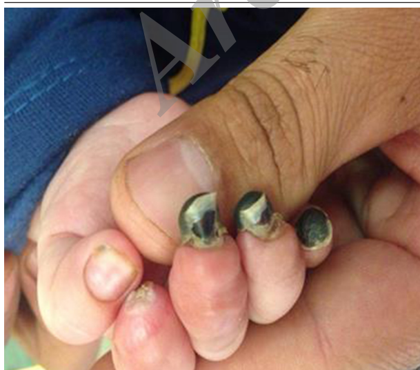
Figure 2. Peripheral Gangrene as a Presentation of Kawasaki Disease