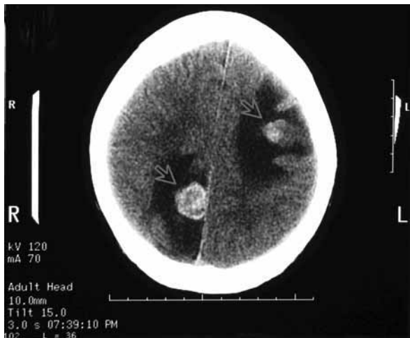
Figure 1. Brain metastasis (Case 1).

presumptive diagnosis of encephalitis and symptoms of convulsion, unconsciousness and left-sided paralysis in November 2002. A week prior to admission she had been complaining of severe headache, nausea, vomiting and convulsion. On admission the chest X-ray and other usual imaging studies were normal. She had a history of stillbirth about a year prior to admission and amenorrhea for 3 months. The pregnancy test was positive but the sonography did not show gestational sac. During admission she developed vaginal bleeding and the \beta hCG level was 1300 mIU/ml. A probable encephalitis induced abortion was considered. Two days later \beta hCG was reported as 17560 mIU/ml. She developed neurological symptoms such as urinary incontinence and limitation in movement. Abdominal and brain CT-Scan was performed which showed multiple metastatic lesions in brain figure 1. She was transferred to gynecologic oncology department for further management. With diagnosis of metastatic GTN, she was started on chemotherapy. After the first course, multi-agent chemotherapy, she was treated