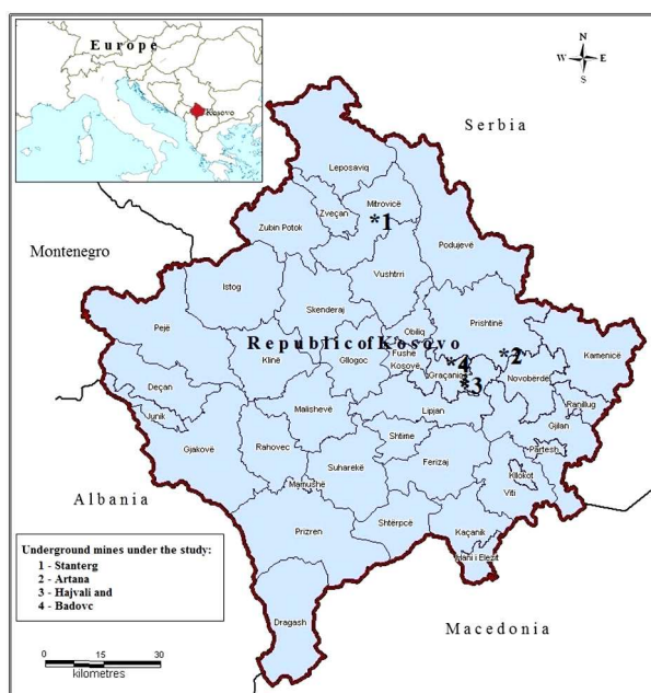
Figure 1. Location map of Kosovo underground mines under the study.

Underground miners are also the subject of the external gamma radiation. The gamma exposure (dose rate) was determined using fully