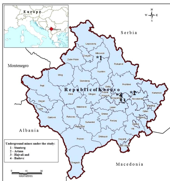
Figure 1. Location map of Kosovo underground mines under the study.

Underground miners are also the subject of the external gamma radiation. The gamma exposure (dose rate) was determined using fully