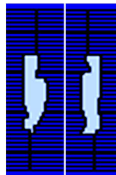
Figure 1. The simulated MLC configuration for the medial and lateral tangential breast fields using the exported plan data from TPS.