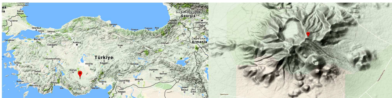
Figure 1. A map of Karadağ Mountain, Turkey (study area).

at the latitude of 37.25°N and the longitude of 33.08°E. It's between the Mediterranean region and the central Anatolia region of Turkey (figure 1). It is about 25 km north of Karaman. The peak of the mountain is 2.25 km east of this plain and its altitude is 2271 m.