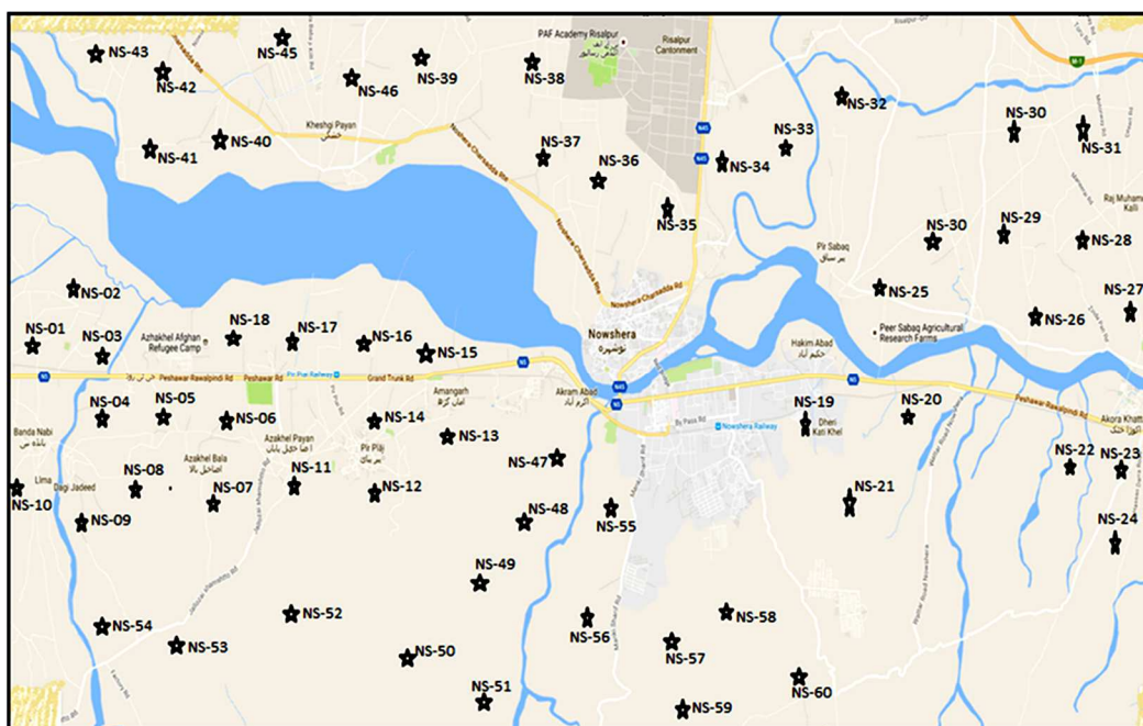
Figure 1b. Map of Nowshera area and location of sampling sites (NS1 to NS60).