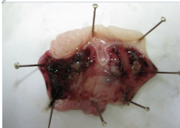
Figure 2. Severe gastric erosions, ulcers and hemorrhage induced by ethanol in rat after 14 days (negative control group treated by saline).

some agents such as indomethacin, alcohol, and aspirin produce oxygen free radicals and enhance lipid peroxidation (23). A powerful relationship has been observed between lipid peroxidation and ulcer formation in the stomach (24). Ethanol induces gastric damages through the oxidative stress and producing of reactive oxygen species (25). Results of our study indicated the hydro-alcoholic extract of Q. brantii extract decreased