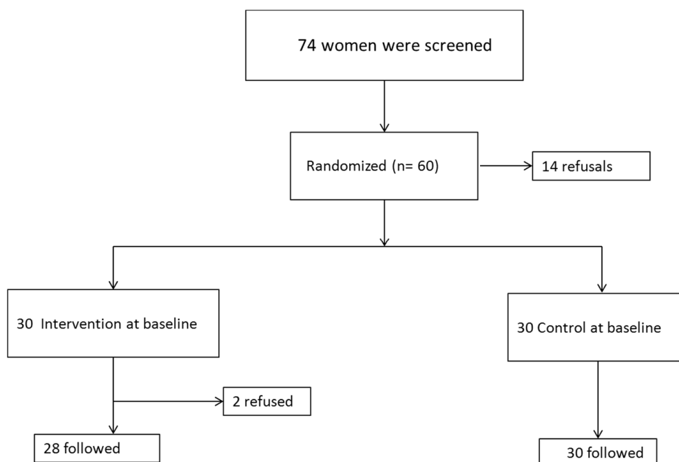
Figure 1. Flow chart of the study participants.

presenting part as first described by Bishop Score (8).