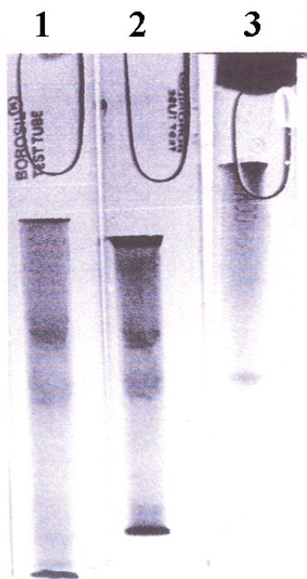
Figure 3. SDS-Polyacrylamide tube gel electrophoresis of purified Ag-binding metallo-protein from fraction 18 of DEAE cellulose column chromatography. The protein was concentrated by lyophilization and 60 \mu l of the solution was loaded into the gel. The SDS gel was also containing 10% urea and 5% mercaptoethanol.

nii BL54 seems to be different from pervious reports (Mergeays et al. 1978; Silver, 1992; Slawson et al. 1994; Stradoub and Trvors,1990). Study of silver accumulation in strain BL54 and plasmidless sensitive derivative (BL54.1) revealed large amounts of silver associated with resistant strain BL54. The accumulation of silver was evident from washing the cells with EDTA that removes surface bound Ag and by treatment with toluene and antibiotics. The results were further confirmed by DCCD and DNP. The above information support the energy dependent Ag accumulation in strain BL54 and activity of this process was inhibited by uncoupler of proton motive force (DNP) and F_1F_0 ATP synthetase in the membrane (DCCD). Accumulation of Ag may occur in two stages: