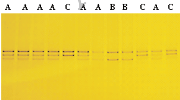
Figure 1. Different SSCP patterns of amplified fragment of bovine IL8 promoter region (A: GA genotype, B: AA genotype and C: GG genotype for IL8-180 SNP)

The associations between IL8-180 genotypes with milk production traits and SCS are listed in Table 3. Results indicated that different genotypes in this fragment had a significant association with average daily milk yield ( P < 0.05 ). Cows with GG genotype had significantly increased milk yield relative to the GA and AA genotypes. There